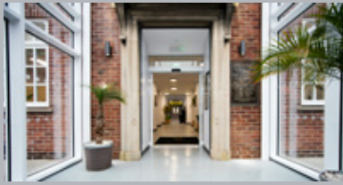
Small Animal Care Centre