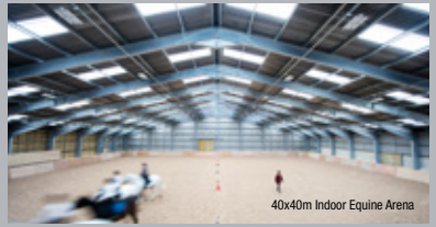
40x40m Indoor Equine Arena