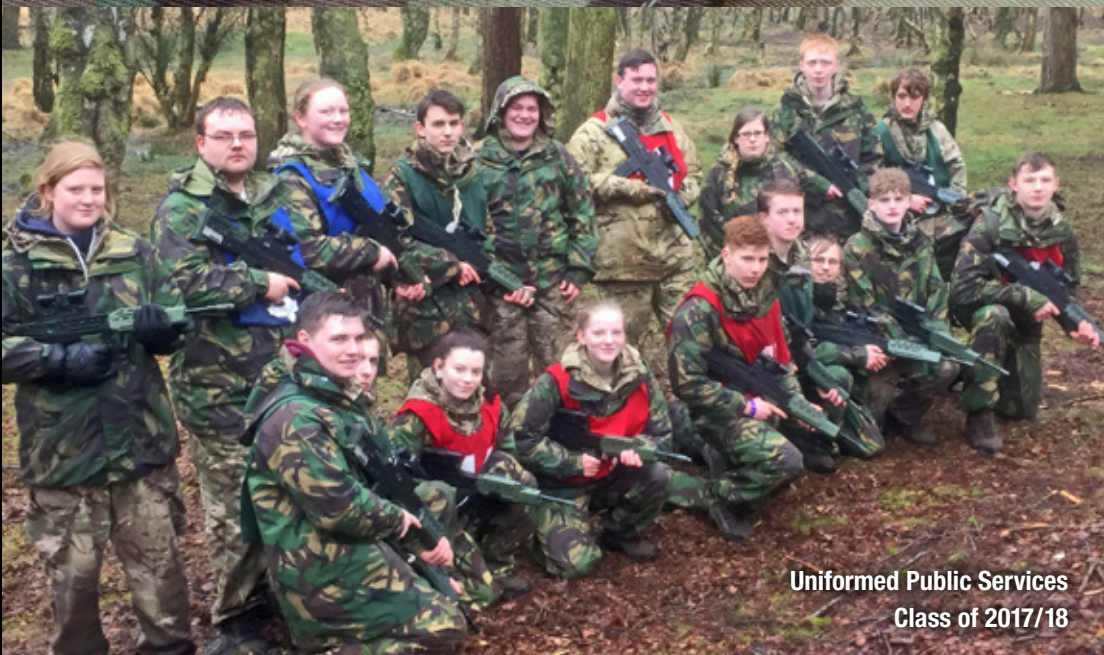
Uniformed Public Services Class of 2017/18